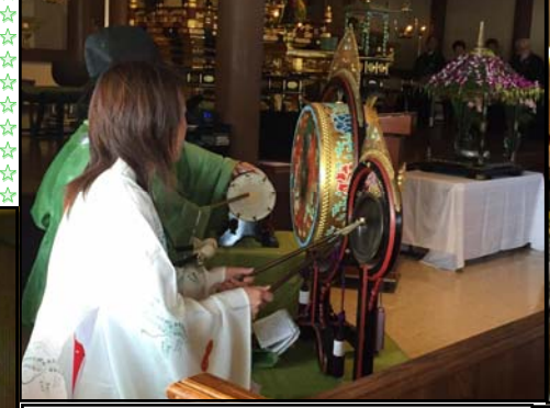
Gagaku music at the Hawaii Buddhist Council's Buddha Day Service at Higashi Hongwanji Betsuin.