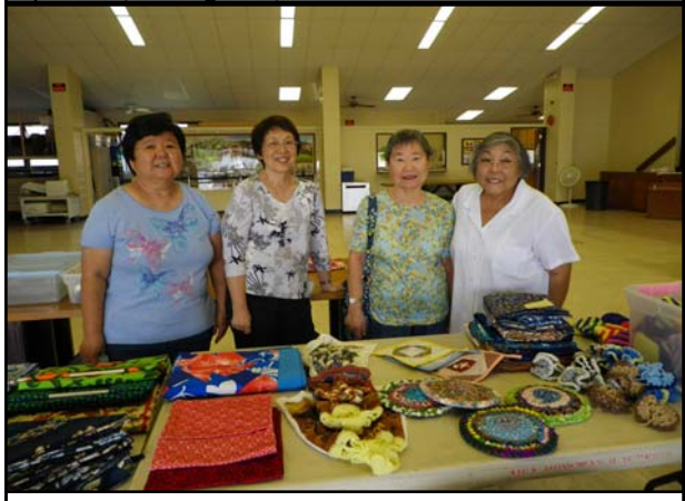
BWA crafters with some of their handiwork at the Craft Fair following our Eshinni-Kakushinni Day Service on April 24, 2016.