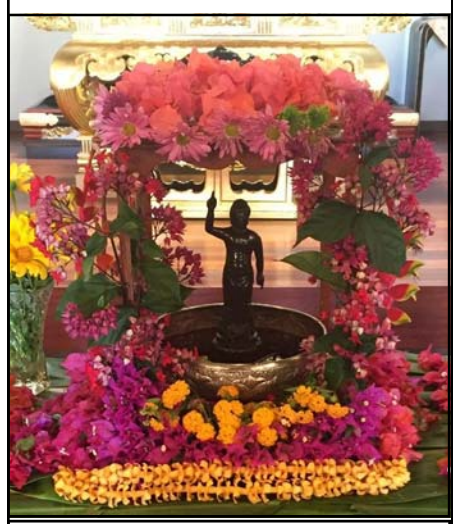
Close up of Aiea's beautifully decorated Hanamido. Thank you for your flowers!!