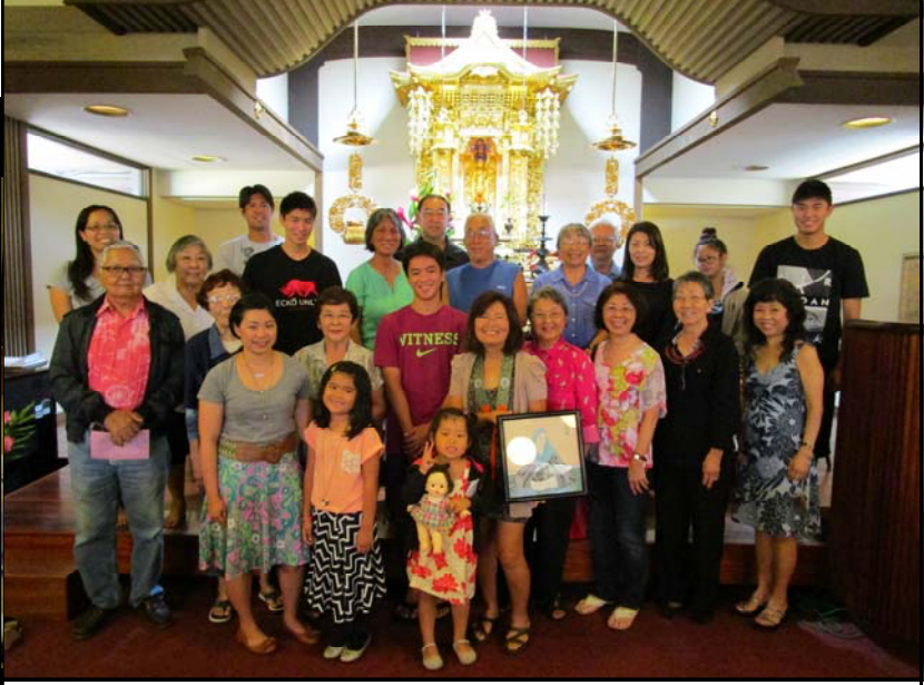
Eshinni Kakushinni Day Service at Aiea Hongwanji Mission on April 24, 2016.