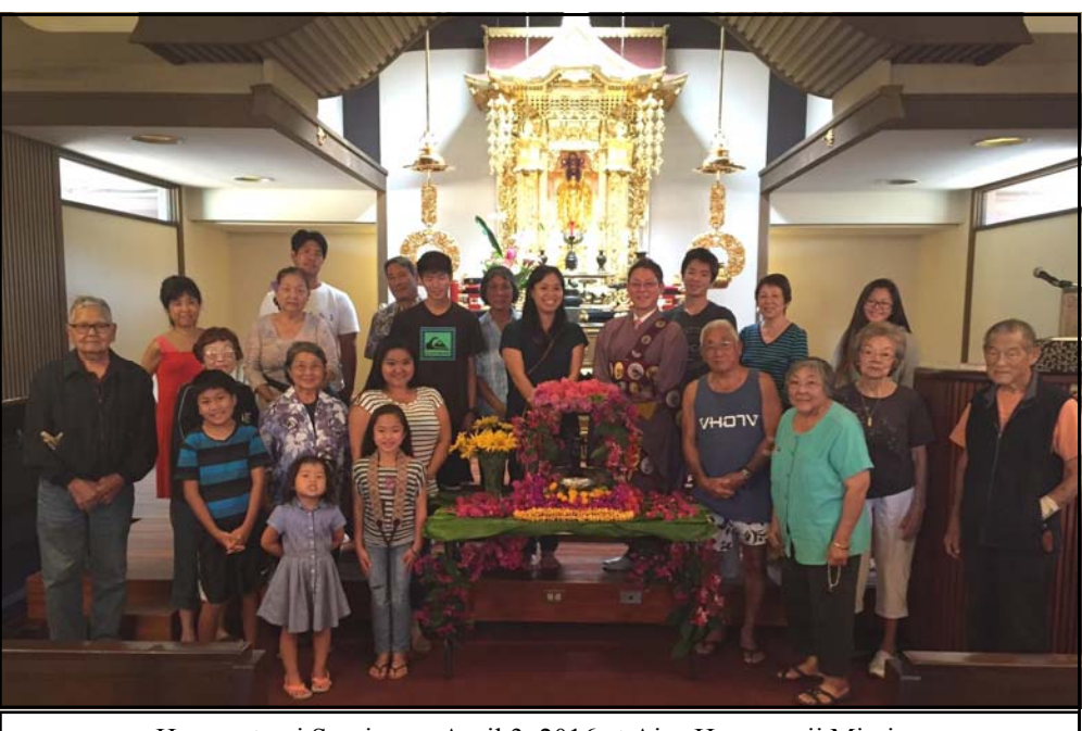
Hanamatsuri Service on April 3, 2016 at Aiea Hongwanji Mission