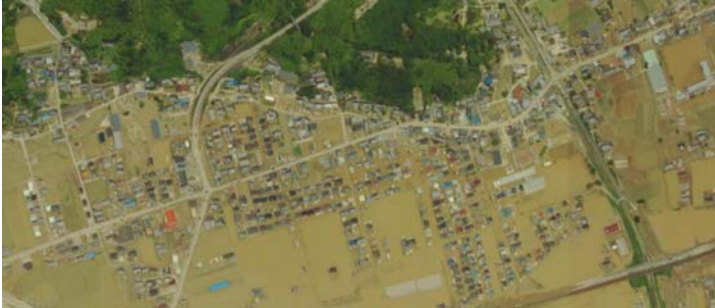
Takahashi River, Wakayama Prefecture—Wikipedia

Summer 2018 flooding throughout western Japan has killed over 220 people and dislocated many thousands. High temperatures and shortages of drinking water, food, and electricity have compounded the disaster. As of July 20th, at least 99 Jodo Shinshu temples were damaged. Members of at least 182 Jodo Shinshu temples were affected, with nearly 50 dead or missing.