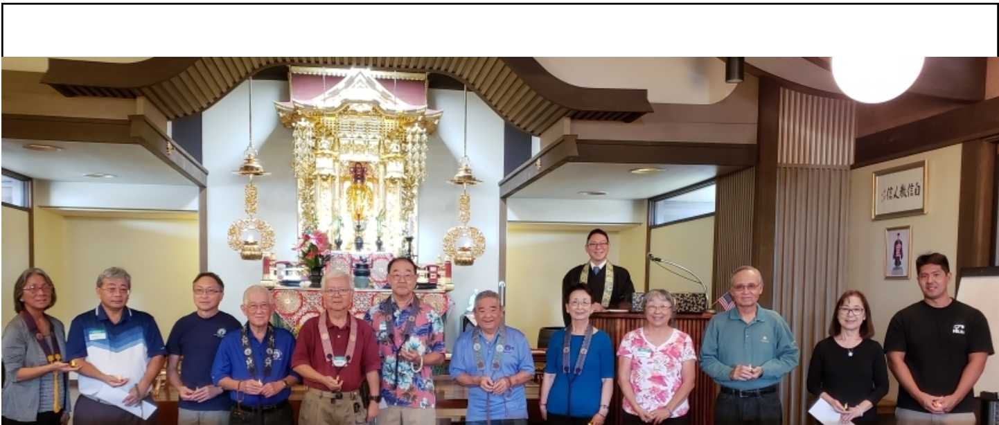
Our Aiea Hongwanji Mission Officers and Board for 2019 thru 2020.