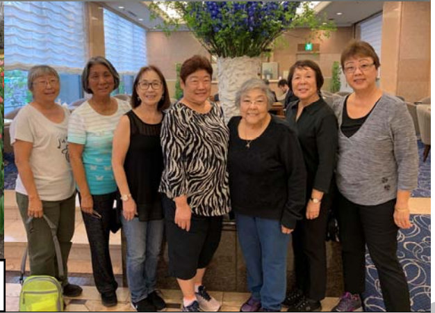
BWA women on the last day of the trip. →