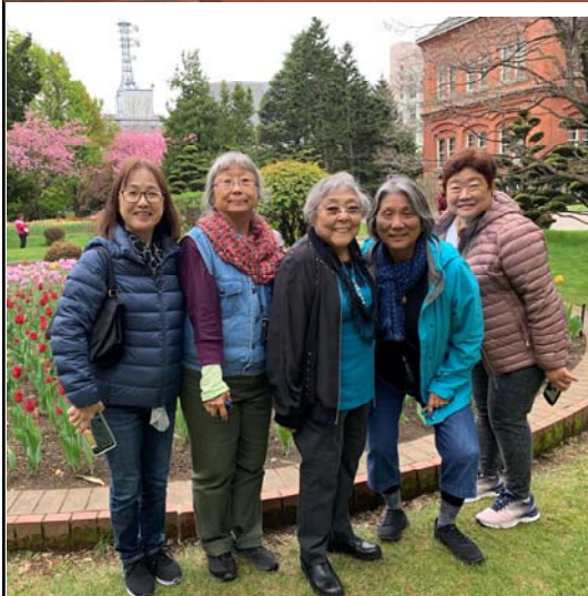
Aiea BWA Hokkaido Trip