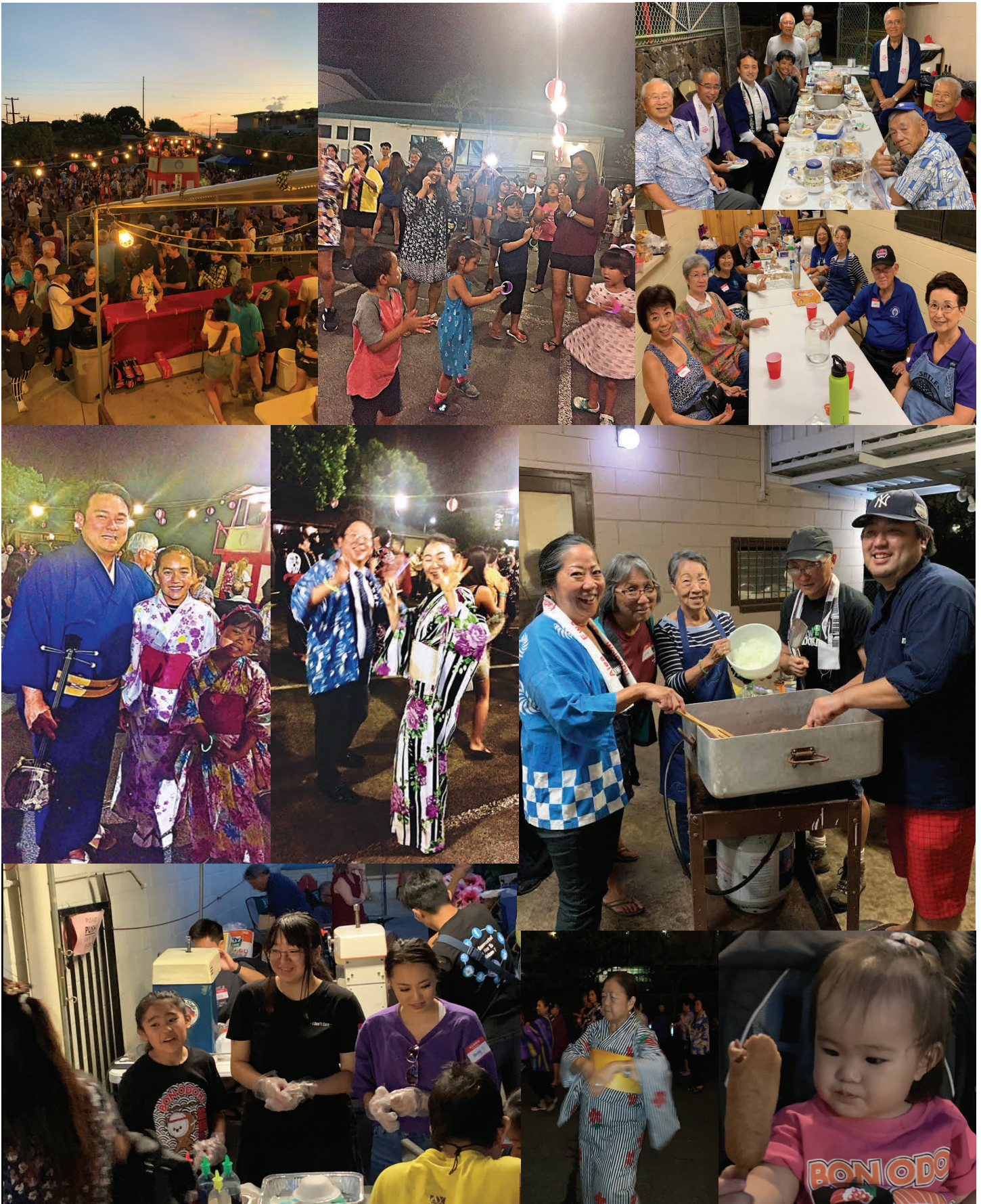
Many selfless and compassionate individuals...members, families, and friends all gathered together to create a warm and very memorable 2019 O'Bon at Aiea Hongwanji on Saturday, July 27th.