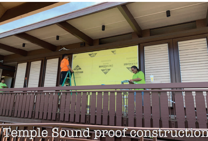
Temple Sound proof construction