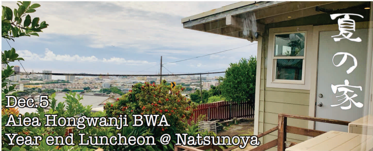
Dec. 5 Aiea Hongwanji BWA Year end Luncheon @ Natsunoya