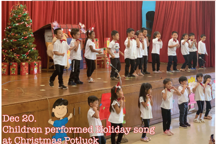
Dec 20. Children performed Holiday song at Christmas Potluck