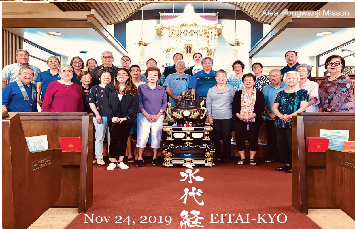
Aiea Hongwanji Misson